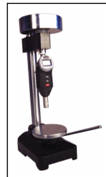
Operation stand TH210FJ

The operation handle evenly applies the force to the sample; adjusts the testing height to meet the measurement of different sample thickness.